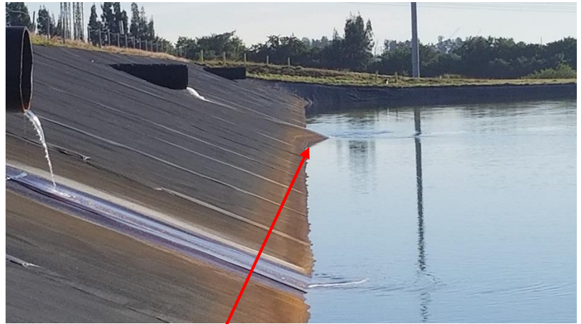
Bulge beneath pipe