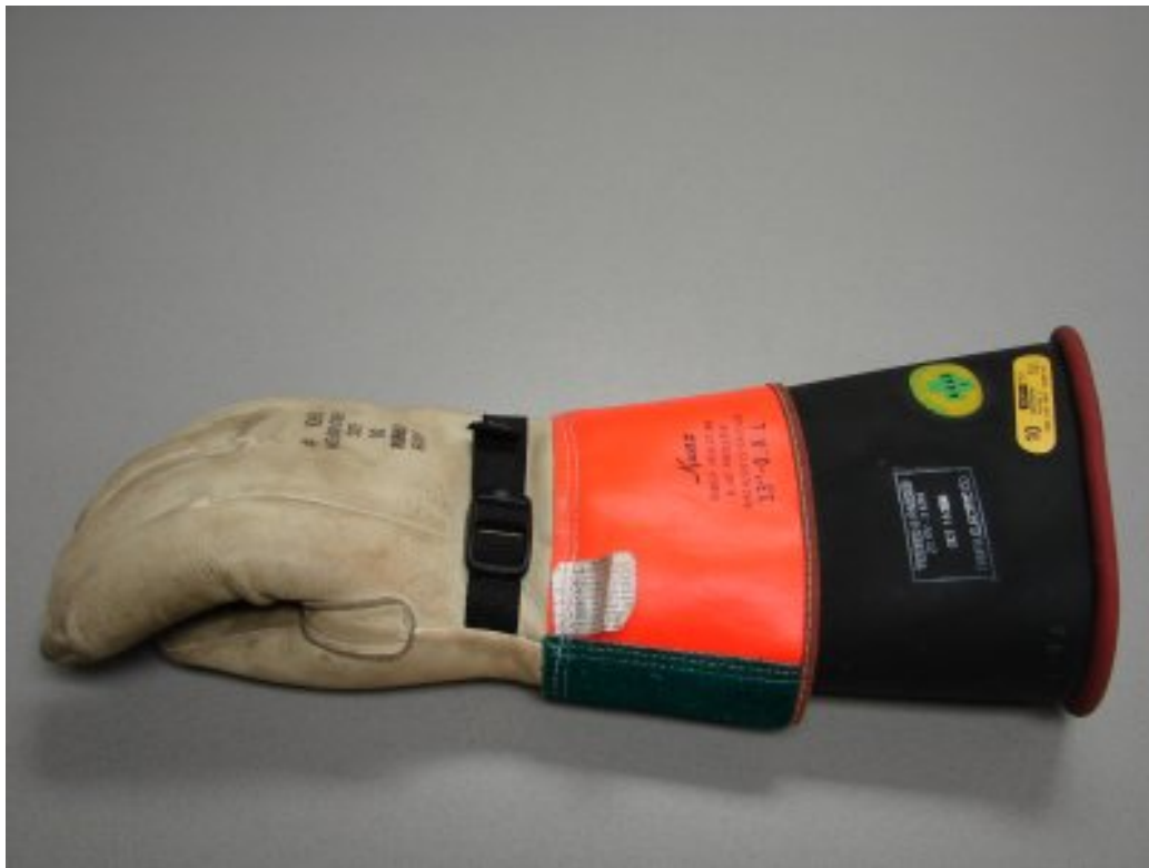
RUBBER GLOVE PROTECTORS

Rubber glove protectors are leather gloves with a long cuff that are worn over the rubber gloves to help protect them from punctures, cuts, and scratches. The cuff of the protective glove is colored with a fluorescent material to make them easily identifiable for both the user and the observer of work being done in a primary area. PROTECTIVE GLOVES SHALL NOT BE USED AS A SUBSTITUTE FOR CANVAS GLOVES OR WORK GLOVES. Protective gloves shall be checked visually on a periodic basis to make sure they have no rips or tears.