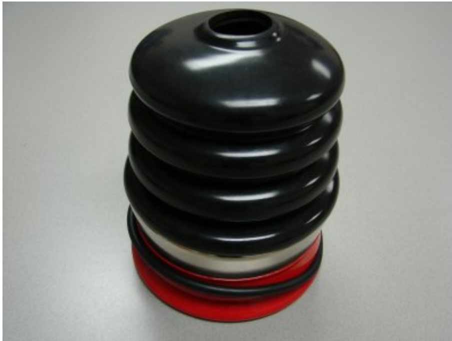
PORTABLE GLOVE INFLATOR

Portable glove inflators are available to mechanically inflate rubber gloves for testing. This testing procedure is much more thorough than the physical air inflation method for two reasons. First, with the physical air inflation method, the sound of escaping air is your primary indication of glove failure. The higher volume of air created inside the glove by the mechanical air inflator allows you to visually check for defects that might not allow an escape of air. (These types of defects will be explained later in this module.) The second reason mechanical air inflation is more thorough is because the cuff does not have to be rolled up; it too can be examined for defects.