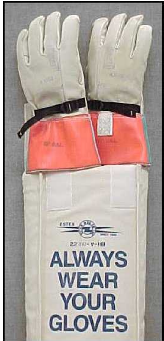
CANVAS GLOVE BAG FOR RUBBER GLOVES