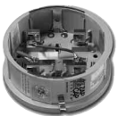
Meter based unit for homes 200 Amps or less

NOTE: Depending on the size of the electric service to your home, you will receive one of the following primary units.