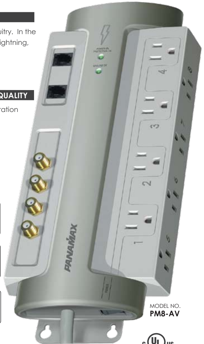
MODEL NO. PM8-AV

Hi Def Ready Hi-Def Designed to work with your High Definition system.